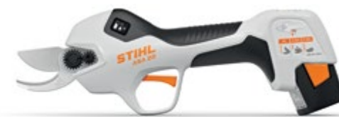
ASA 20 BATTERY SECATEURS