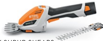
HSA 26 BATTERY SHRUB SHEARS 10.8V • 0.7KG# • 20CM/8" • 12CM/5"®

Precise cutting. Easy handling. Minimal effort. Optimised shrub cutter and grass trimmer blade options.