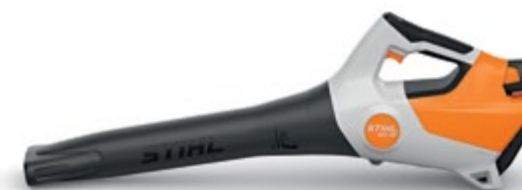
BGA 30 BATTERY BLOWER