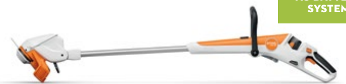
FSA 30 BATTERY GRASS TRIMMER