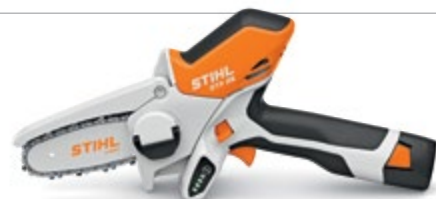
GTA 26 BATTERY GARDEN PRUNER 10.8V • 1.2KG# • 10CM/4"

Now expanded to 11 light, compact and easy-to-handle tools, tackling small and precise outdoor tasks is impressively easy with the STIHL AS System.