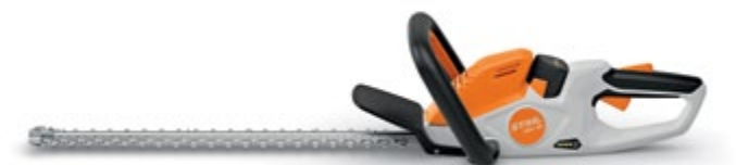
HSA 40 BATTERY HEDGE TRIMMER