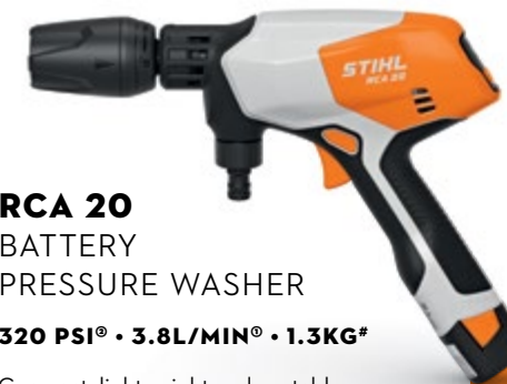
RCA 20 BATTERY PRESSURE WASHER