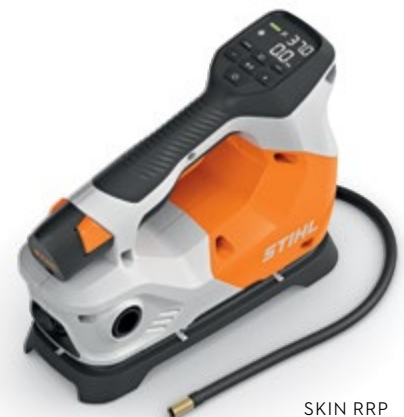
KOA 20 BATTERY AIR INFLATOR